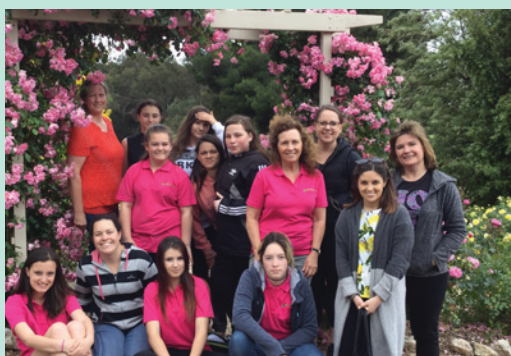
Older Teen Girls Camp