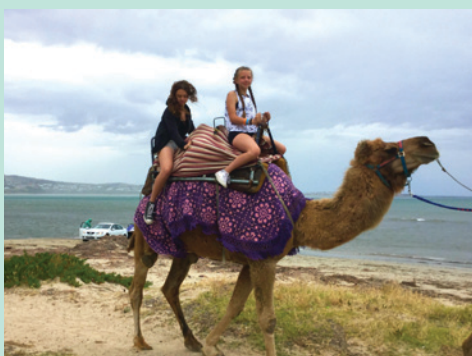
Younger Teen Girls Camp

Historic museum tour, ten pin bowling and a rose garden visit.