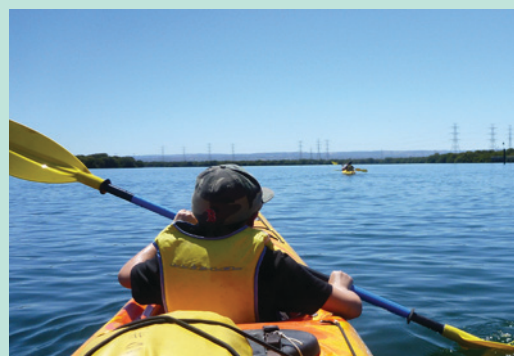
Younger Teen Boys Camp

Camel rides, Duck Boat ride, bird and animal feeding.