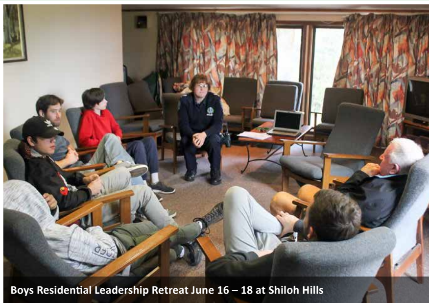
Boys Residential Leadership Retreat June 16 – 18 at Shiloh Hills

Thanks to Have Your Say over 2,400 voters from the public rallied behind our program, Rescuing PKs (Prisoner's Kids) as part of Fund My Community . Our Rescuing PKs program delivered six character building residential retreats with custom designed interventions to keep 24 at-risk PKs out of the justice system.