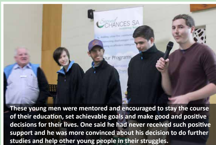
These young men were mentored and encouraged to stay the course of their education, set achievable goals and make good and positive decisions for their lives. One said he had never received such positive support and he was more convinced about his decision to do further studies and help other young people in their struggles.

instilling perseverance, self-worth, team work, respect, leadership, and practical skills into the lives of at-risk youth. All participants are currently attending school and will continue to be engaged with us in leadership roles through future PK Mentoring Camps .