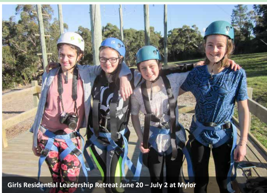
Girls Residential Leadership Retreat June 20 – July 2 at Mylor

Since the winter newsletter three character-building residential retreats included a Younger Teen Girls mentoring weekend in the Adelaide Hills, a Teen Boys Leadership weekend in the Hills also with one for Teen Girls in Hahndorf.