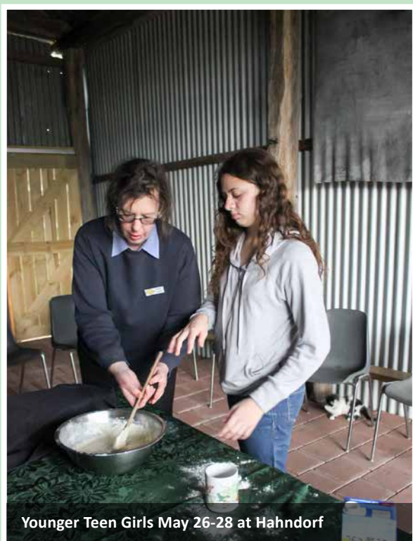
Younger Teen Girls May 26-28 at Hahndorf