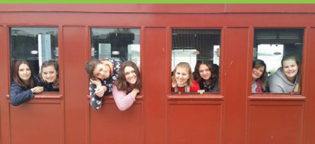
May 11 -13 Teen Girls (Sen) – Fleurieu Peninsula