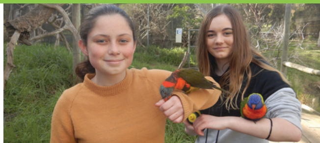
June 29 –July 1 Teen Girls (Jun) – Victor Harbor

Thanks to our wonderful donors and funding supporters CMV Foundation, Boys Brigade and MMF , we have delivered four PK Mentoring Camps so far this year. Due to lack of support we were forced to defer the Autumn Camp for primary age PKs, but the Spring camp is set to go ahead end September.