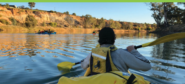
10 – 12 July – Teen Boys (Sen) – Riverland

Thanks to our wonderful donors and funding supporters CMV Foundation, Boys Brigade and MMF , we have delivered four PK Mentoring Camps so far this year. Due to lack of support we were forced to defer the Autumn Camp for primary age PKs, but the Spring camp is set to go ahead end September.