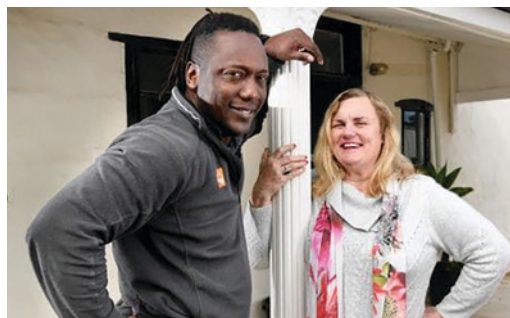
Henry Olonga signed on as the Ambassador Second Chances SA.

She knew she wanted Olonga to be the public face of her organisation as soon as she heard him talk about his journey, intensifying the moment she heard him sing.