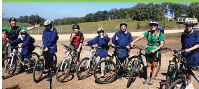
April 17-19 Teen Boys (Jun) – Mt Crawford