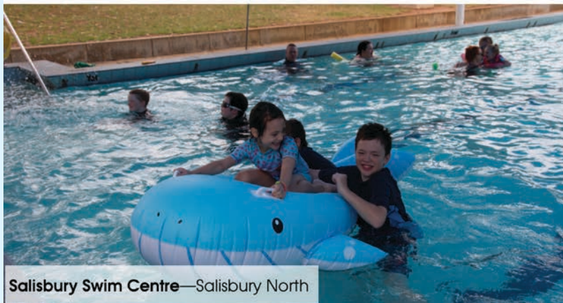
Salisbury Swim Centre—Salisbury North