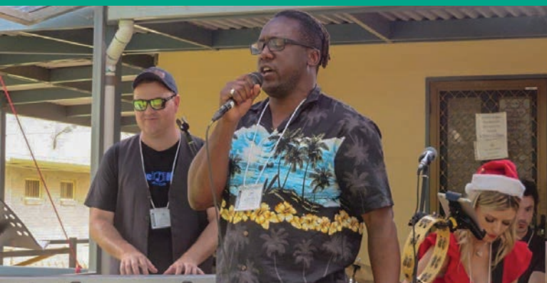
Henry Olonga sings for families at Cadell Training Centre