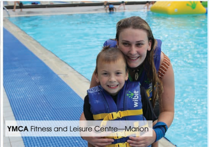
YMCA Fitness and Leisure Centre—Marion