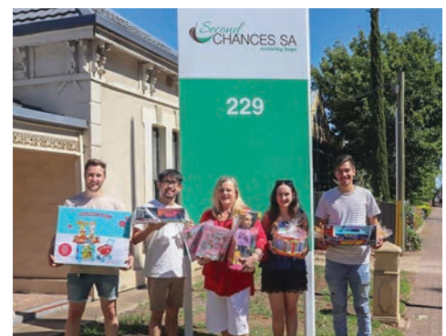
Influencers Church deliver over 300 presents for PKs