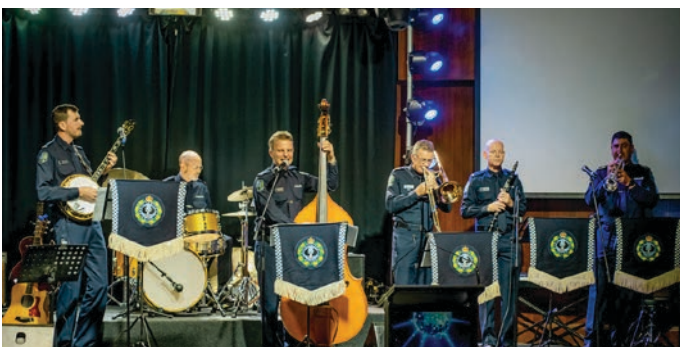
South Australian Police's Dixie Band open the night's musical entertainment