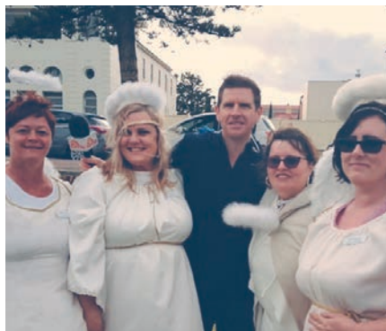
Four Christmas Angels on Channel 7 Sunrise

"I just wanted to say a massive thank you for everything you do and the presents you got my children. With a 1 income family, Christmas time can be quite hard with one parent in prison. But my husband is now on home visits so we are having "Christmas" today with him at home and he was able to bring the gifts and give them to the kids himself. I thought you would appreciate the photos of our kids opening them up."