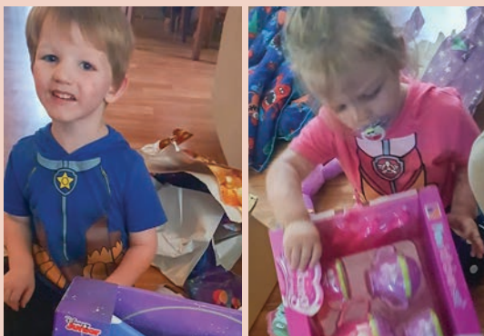
Happy kids open their Christmas Angels presents