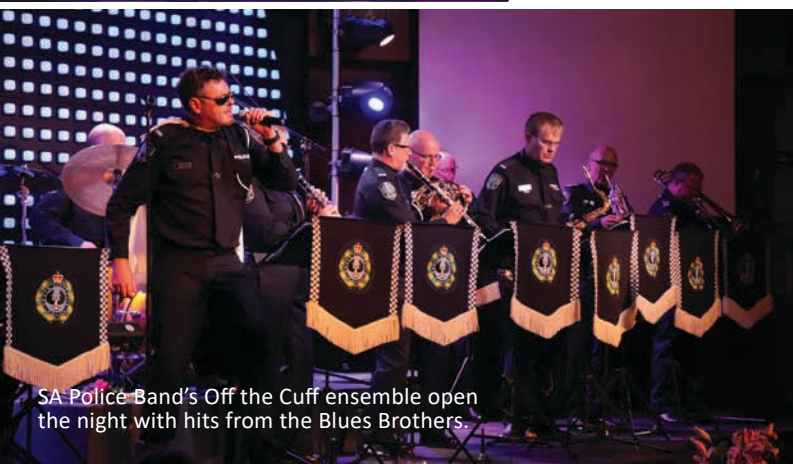
SA Police Band's Off the Cuff ensemble open the night with hits from the Blues Brothers.