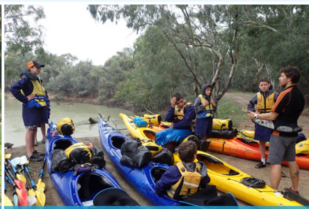
Older Teen Boys Character-Building Retreat – January 2017