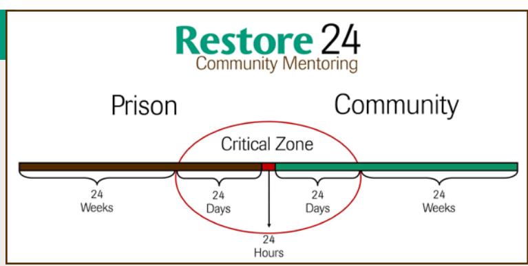
The first 24 hours is the most critical time post release.

For those who are supported and committed to turning over a new leaf – there is hope. "I know community mentoring has definitely been a turning point in their lives," he says with an optimistic twinkle in his eyes.