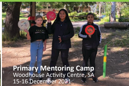
Primary Mentoring Camp Woodhouse Activity Centre, SA 15-16 December 2021