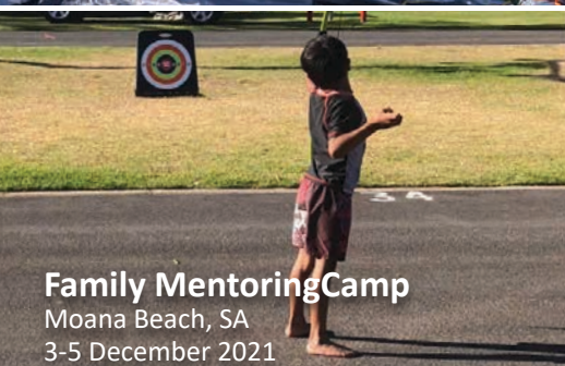
Family Mentoring Camp Moana Beach, SA 3-5 December 2021