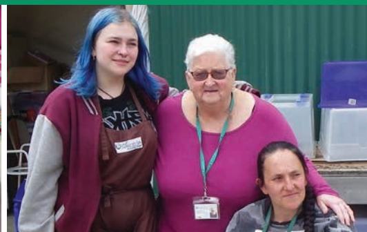
Three generations of volunteers L:R Grand Daughter, Grandmother & Daughter