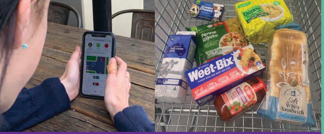
Sitting a practice Learners Driving Test