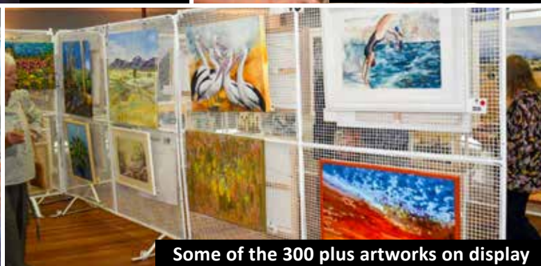
Some of the 300 plus artworks on display