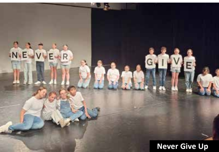
Never Give Up